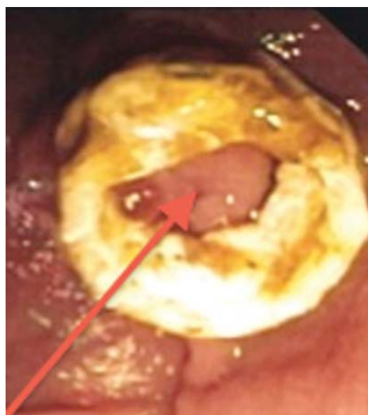
Figure 1. Endoscopic view of an Allium stent anchor in the duodenum. The papilla is marked by an arrow.

As the use of cSEMS was a new technique in our clinic, several patients, with emphasis on early stenting entities, had their cSEMS routinely changed three to four months after deploying the stent. In addition,